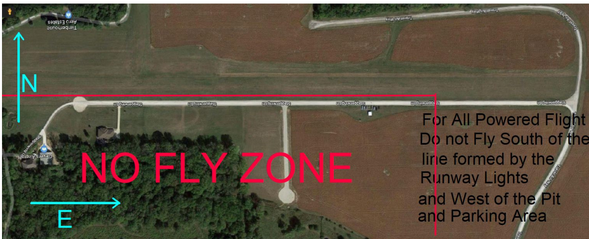
Figure 2 – Power Layout - South Field ( Timberhouse Estates)