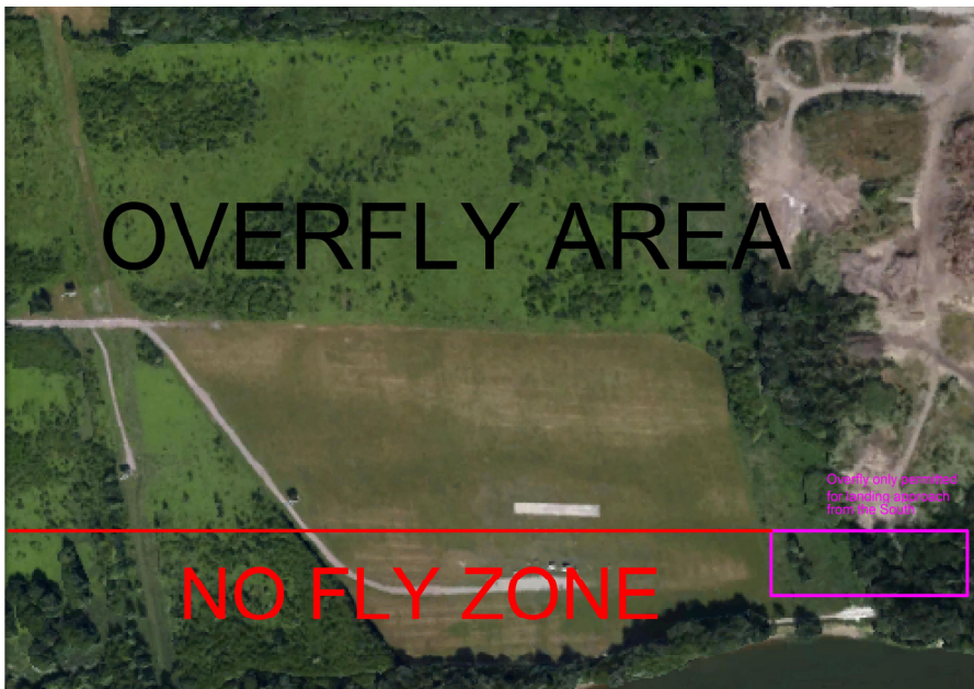
Figure 1 - North Field (McAlister Park)