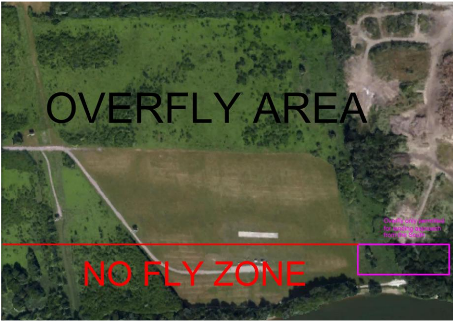
Figure 1 - North Field (McAlister Park)